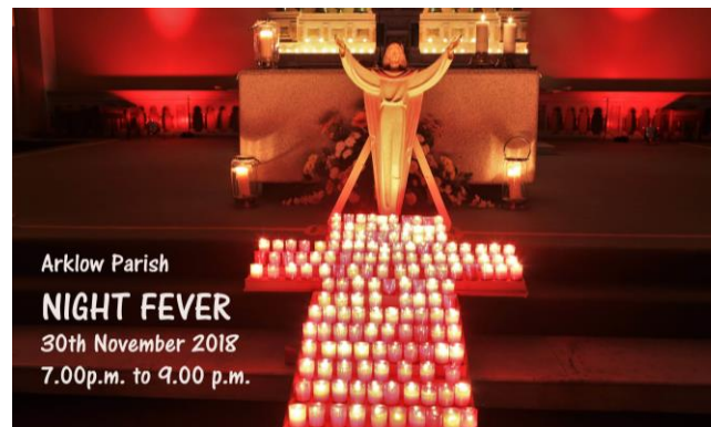
Arklow Parish NIGHT FEVER 30th November 2018 7.00p.m. to 9.00 p.m.

Congrats to Arklow Geraldines on winning the Wicklow League recently. Good luck to the U20's football team in the final this weekend.